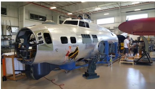
Champaign Museum B-17

Thurs. June 10 at 6:00 pm—Chapter 2 Cookout! - Pat Garvey’s Hangar; Tropria Airport., 11612 State Rd. 205, Churubusco