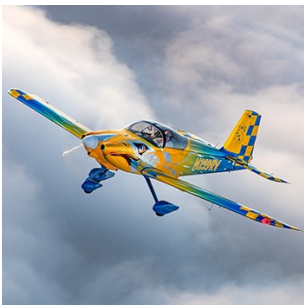
RV Aircraft Anniversary