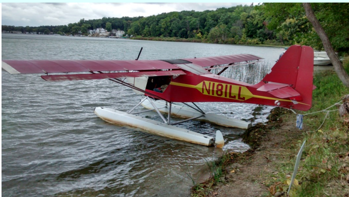
Seaplane Splash-In, Pokagon State Park.

Discussion Question 2 (courtesy of Pilot Workshops): What is the first thing you should try if you get a large RPM drop during your runup?