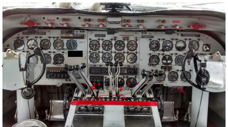
Can you identify the plane? Answer next month.