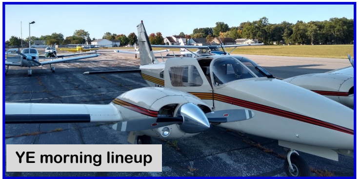
YE morning lineup