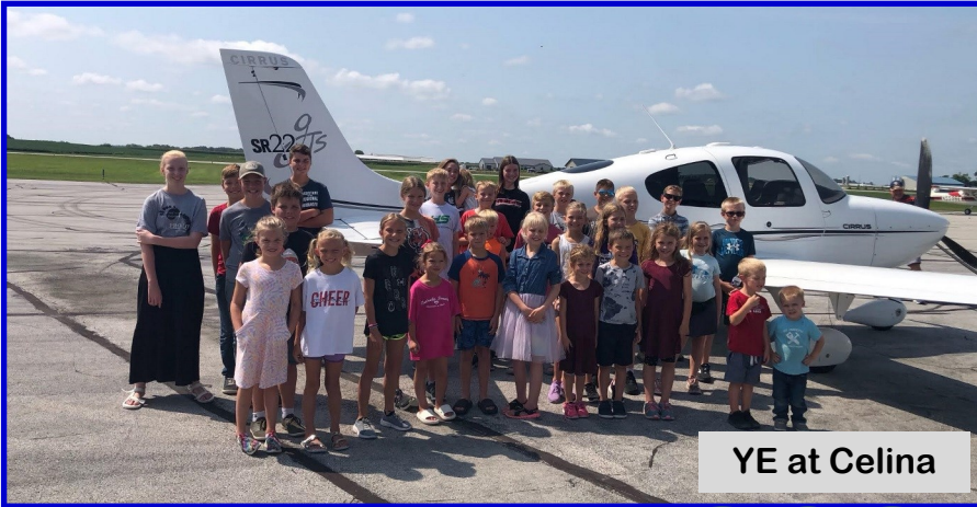
YE at Celina