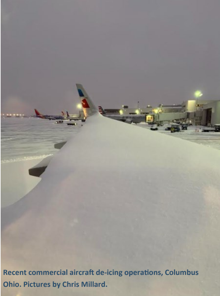
Recent commercial aircraft de-icing operations, Columbus Ohio.

Are you a pilot? Are you building an aircraft? Are you an aircraft owner? Are you just "plane nuts" about aviation?