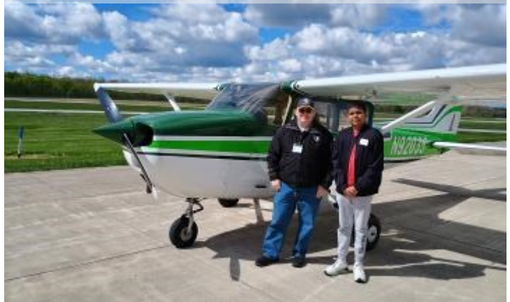
May 2 YE Rally